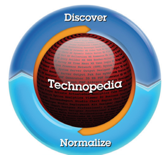
BDNA Technopedia is the heart of the BDNA value proposition.

Because the sequence was co-developed with Oracle LMS, Oracle and BDNA customers can be assured that all critical metrics required to accurately assess a client's compliance have been collected meeting Oracle's exacting standards. The results delivered using this sequence are accepted by Oracle as if collected by their own LMS engagement team.